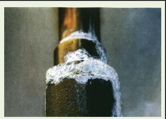
Galvanic Corrosion - An extremely common problem . A combination of water penetration and galvanic activity causing pipe deterioration.