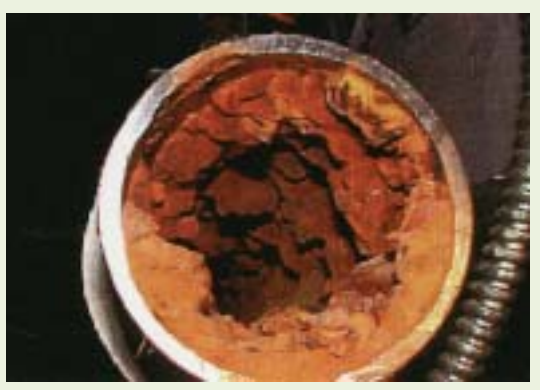
Localized Corrosion - A good example showing particulate deposits settling along the inside of the pipe, which will produce deep deposit pitting.