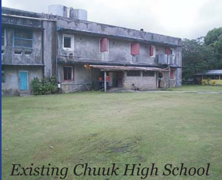
Existing Chuuk High School

61,000 square feet of total retail space 170 residential units (five stories above retail center) Four floors of underground parking Design Architect - Collins Woerman (Seattle, WA) Construction began in June 2008 Completion expected by late 2009, early 2010