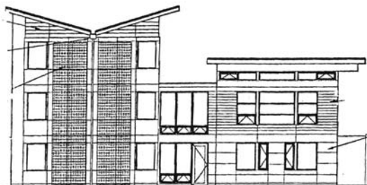
Bastyr University - New Housing

Universal Mechanical Service Company is the mechanical contractor, and the architect is TGB Architects.